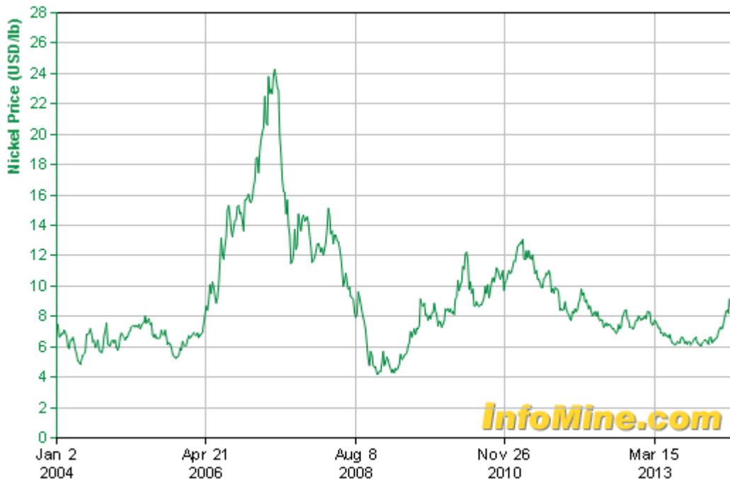
LME Nickel Prices – 10-yr chart

As a result of Indonesia's export ban, nickel prices have skyrocketed. See below a 10-year chart of nickel prices in the London Metal Exchange (LME). After hitting a low of $6/pound in 2013, LME nickel prices have since risen by 42% to $8.55/pound. Though many foreign research firms expected nickel prices to rise, the meteoric rise in nickel prices caught them by surprise. At one point, nickel prices reached as high as $9.80/pound this year.